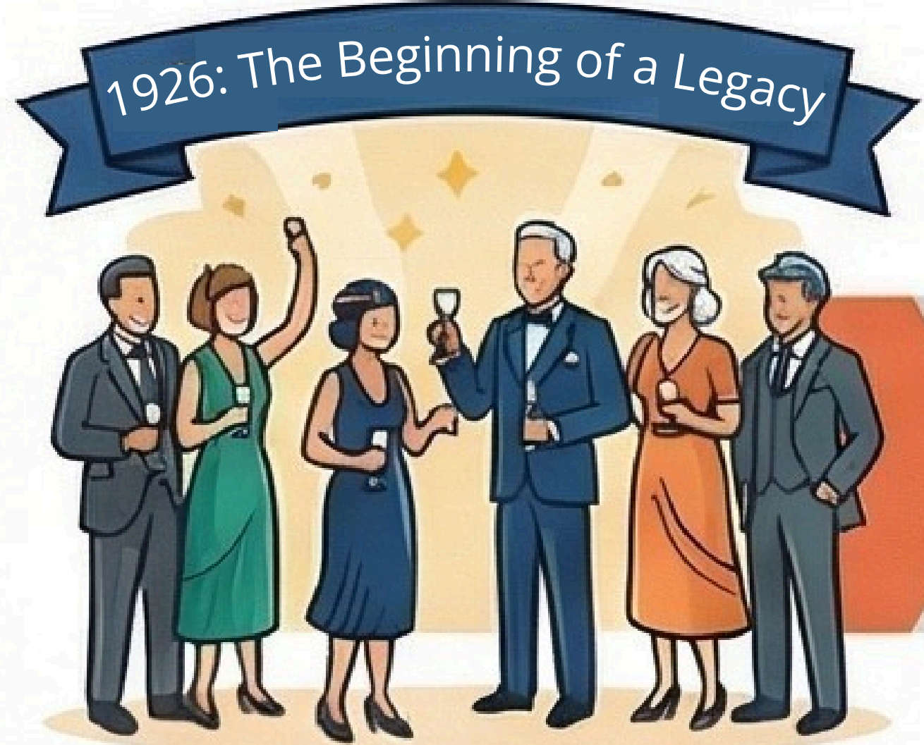
1926: The Beginning of a Legacy